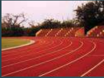
Manohar C Watsa Stadium, we have 400 meters synthetic Track Opposite to Director's Bungalow. The Stadium remains closed between 10 am and 4 pm.