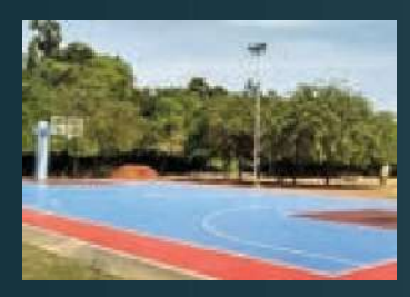
Basketball Court, 2 nos of Concrete court near Volleyball Court.