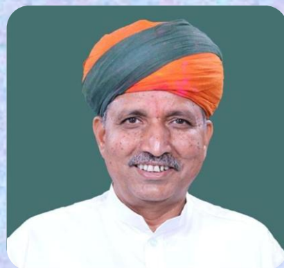
Hon. Shri Arjun Ram Meghwal