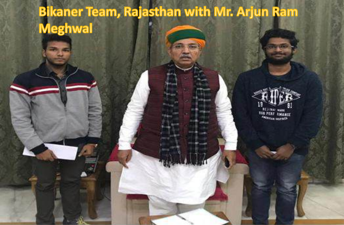
Bikaner Team, Rajasthan with Mr. Arjun Ram Meghwal