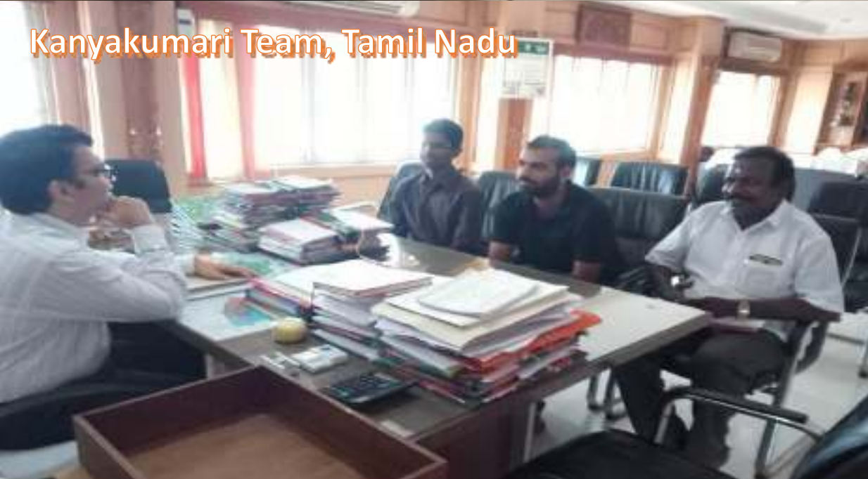
Kanyakumari Team, Tamil Nadu