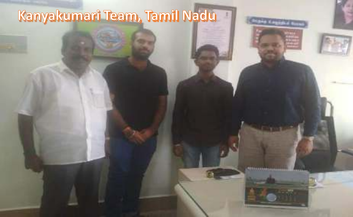
Kanyakumari Team, Tamil Nadu