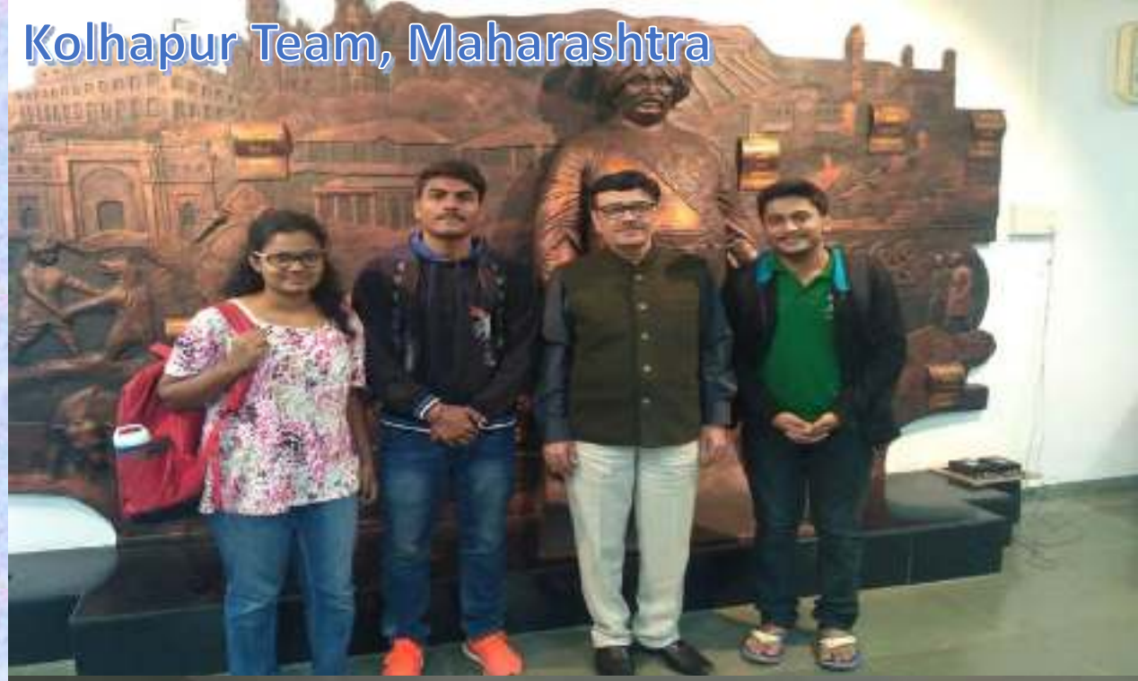
Kolhapur Team, Maharashtra